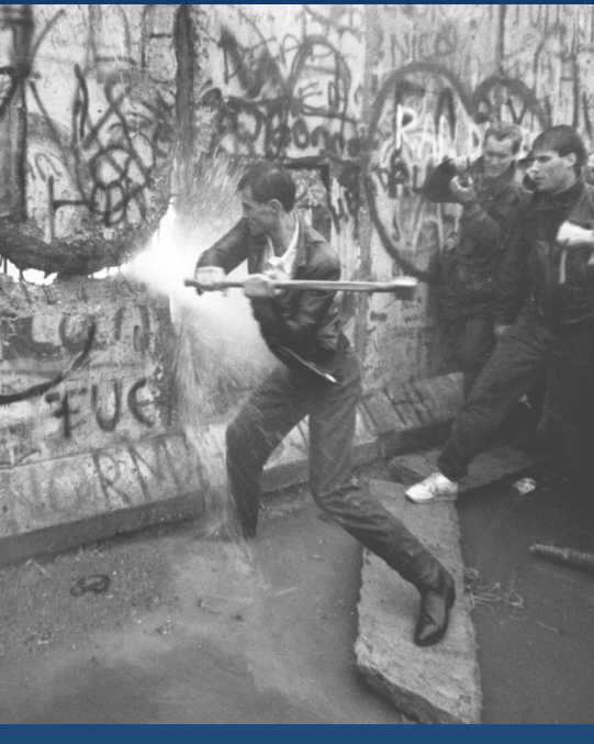
Break the Walls ... Improve your surgical skills